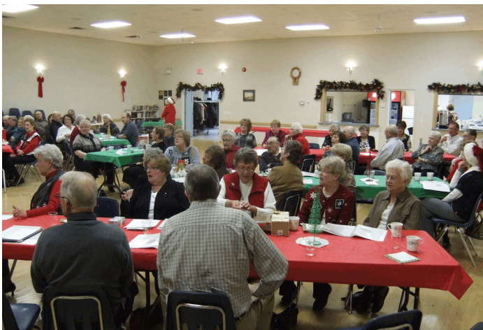
Christmas Social with Melfort Chapter