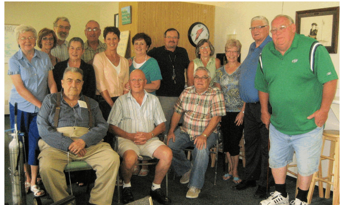
TUCS Colleagues meet at THWTB breakfast