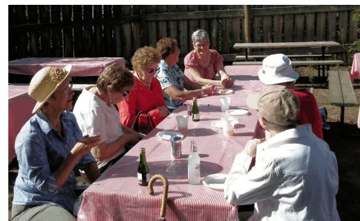
At the Nipawin Chapter Fish Fry

"Big Bert", the crocodile-like creature whose bones were excavated from the bank of the Carrot River about 5 km from the park. After viewing the DVD