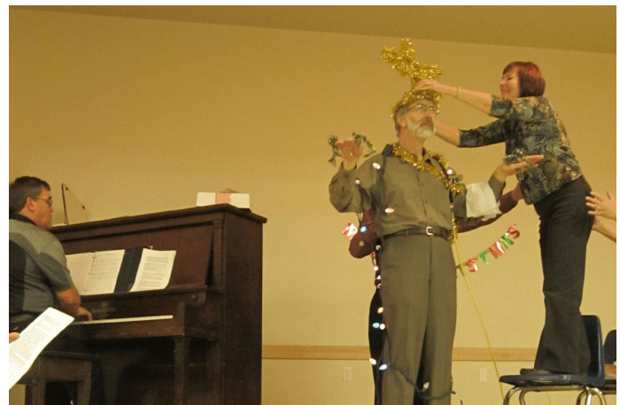
Decorating the Christmas Tree