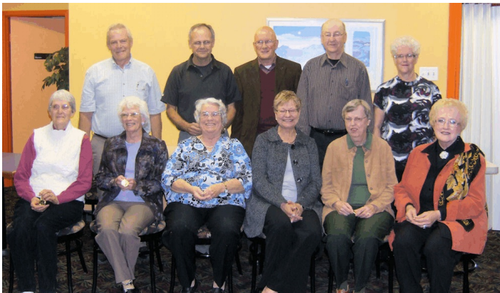
Membership award winners plus some from previous years